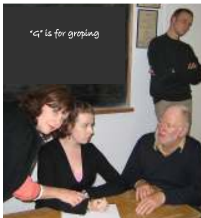
At rehearsals the cast grope for words ..... those of the script!

Ordinary Bookings: Open Wednesday 6th July at Brighton Stationers and Newsagency Shop 8 Brighton Shopping Centre 525 Brighton Road Brighton Telephone 8296 8902