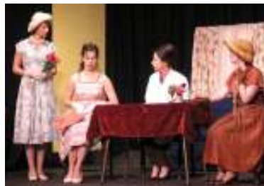
Scene from World Without Men