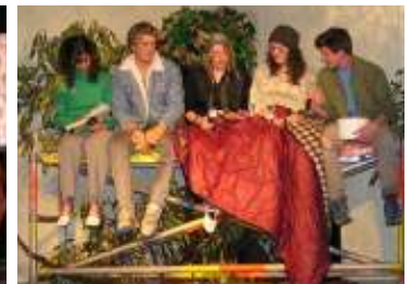
Scene from Taking Breath

Book Your Table for the 8th October phone Isabella on 8296 3366