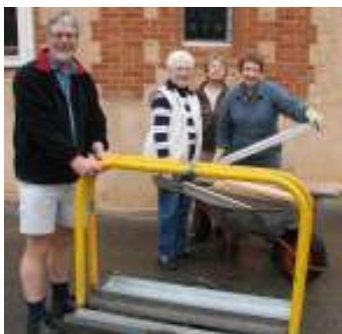
Above: The trolley was super for the flats and heave ho with barrow for bits and pieces!

As reported in our last newsletter, the development of the child day centre is now nearing completion. Our new storage shed has been finished, so recently it was moving day for all our goods and chattels! Thankyou to all our volunteers who did a splendid job with the relocation.