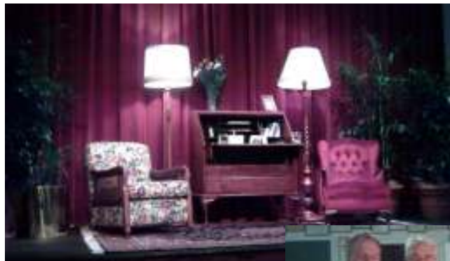
Above: The simple but impressive set of Love Letters