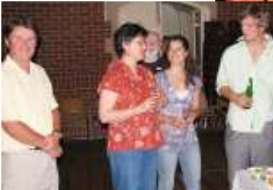
Above left: Lucky prize winner! Above: Awards for 2005 Left: Christmas Party celebrations