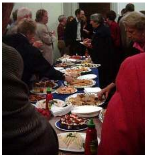
Left: Another sumptuous St Jude's Players Supper!