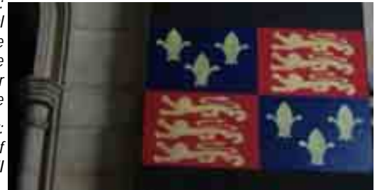
Right: The royal coat of arms of Henry VIII