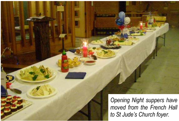
Opening Night suppers have moved from the French Hall to St Jude's Church foyer.